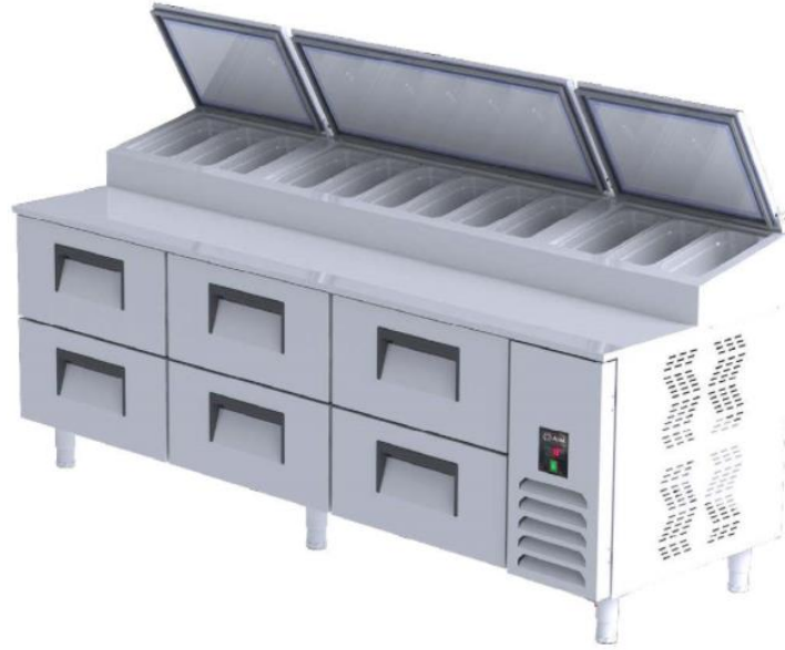
AIM 800USA-3 DRAWER TYPE PIZZA PREPERATION COUNTER