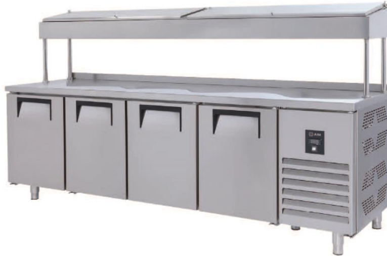
AIM 257M3 MAKE UP REFRIGERATOR -W/4 DOORS - HIGH