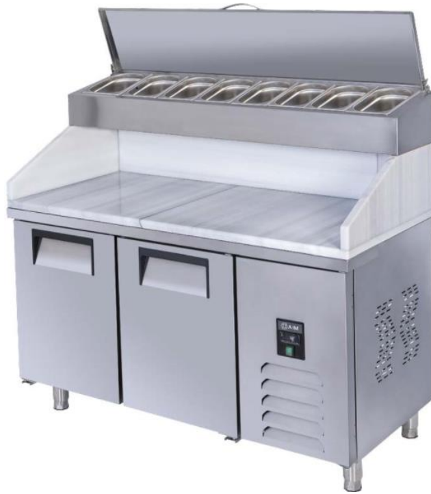
AIM 257M3-SB MAKE UP REFRIGERATOR -W/MARBLE -W/4 DOORS