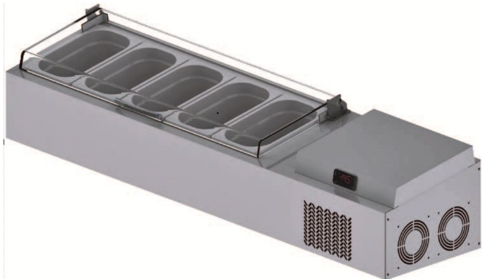
AIM 250PL COUNTERTOP SALADBAR W/ PLEXY COVER