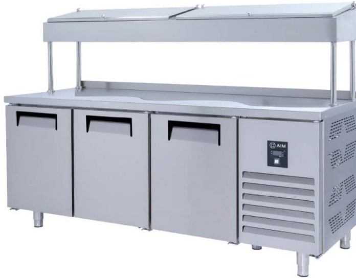
AIM 206M4 MAKE UP REFRIGERATOR -W/3 DOORS - HIGH