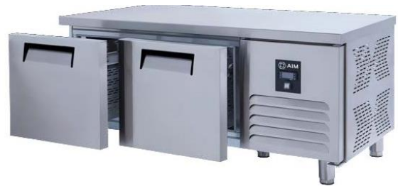
AIM 147LF4 LOW LEVEL FREEZER -W/2 DOORS